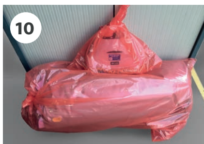
10 Place the pump on top of the mattress in your designated collection area

For more information call Arjo Rental: 1800 00 7368 or email: customerservice-au@arjo.com