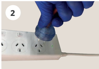
2 Disconnect power cable from socket