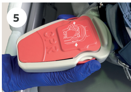
5 Release CPR by squeezing the sides