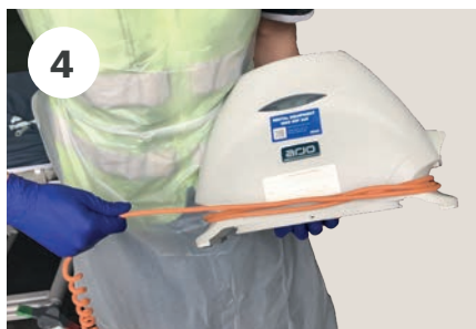
4 Wrap cable around the bottom of the pump