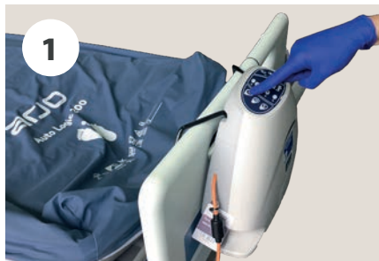
1 Hold down power button to switch off pump