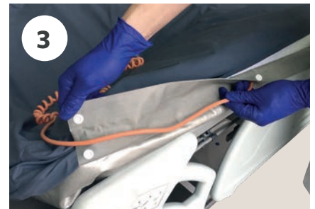
3 Remove cable from cable management system