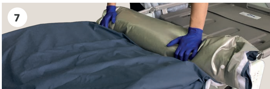
7 Place tubeset on mattress and roll from the foot end towards the head end (roll it once to expel majority of the air, then retry rolling it to achieve a tighter roll)