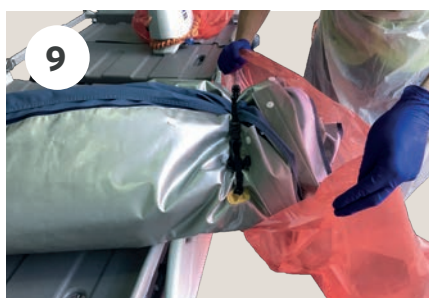
9 Bag mattress and pump